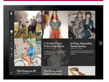
NYTimes: The Collection CULTURE & MEDIA / 14:00 / 18 NOV 2011 The New York Times has launched The Collection – an iPad app dedicated to the newspaper's fashion and style editorial