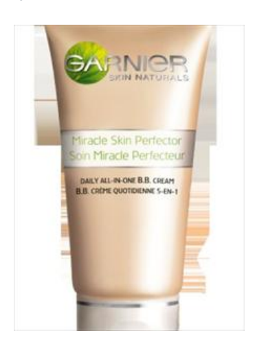
GALLERY / 1 MORE IMAGE