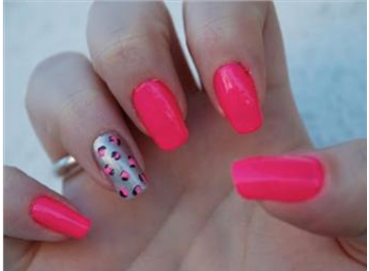
GALLERY / 3 MORE IMAGES